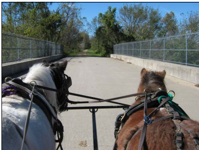
Cathy's view from behind the team

There was one small water hazard from the recent rain that everybody maneuvered with ease, even though Jake had to push Dallas into the water.