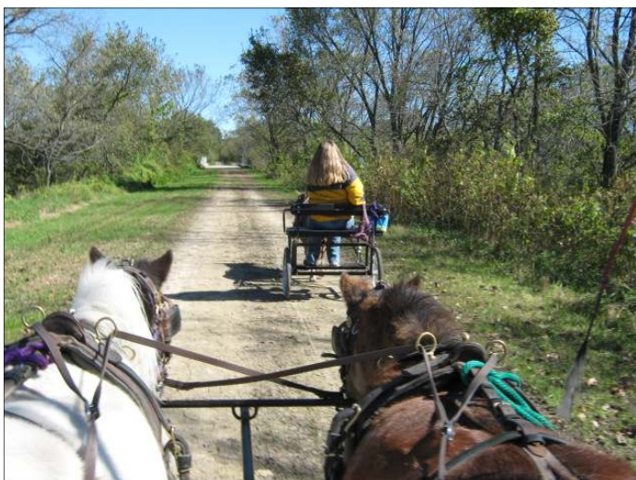
The view, again