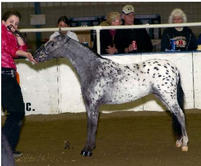
Indian Creeks Princess