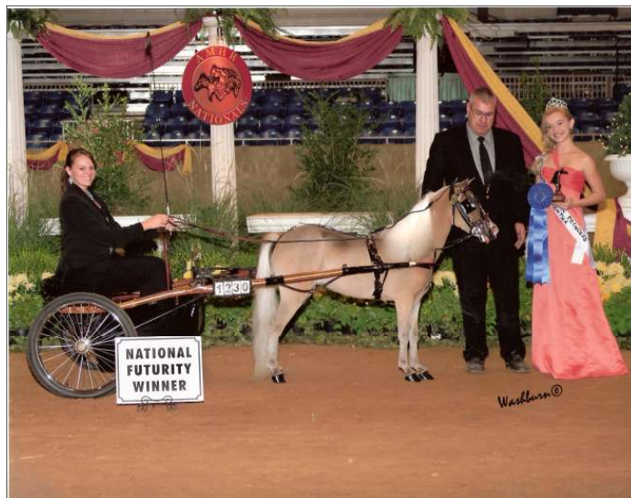
DM Sonny's Toreno