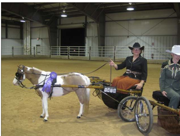
Buckette of Bacardi