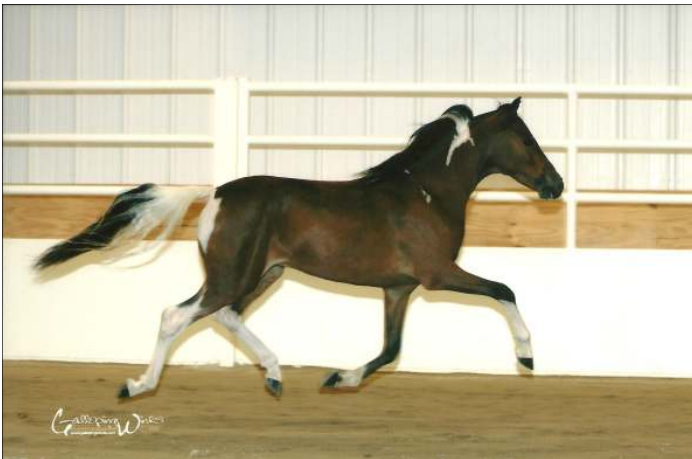
Breaker in Liberty